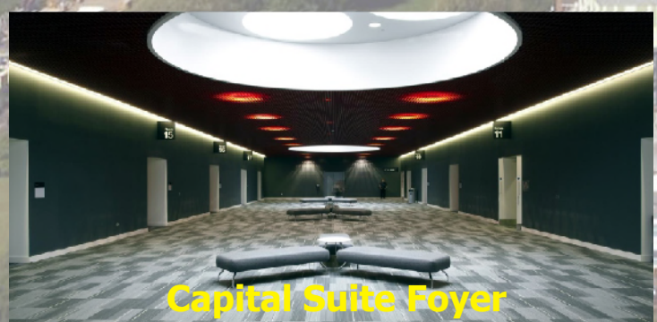
Capital Suite Foyer