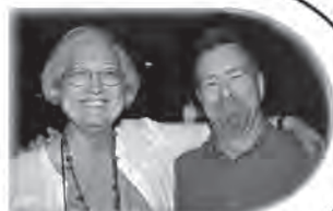
Connie Willis, James Patrick Kelly