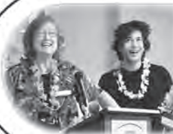
Connie Willis, Neil Gaiman

Special room rates, $131.00 per night, are available for the weekend at the Best Western Executive Inn right across the street from the Experience Music Project/SF Museum, at 925 Westlake Ave., Seattle WA 98109. There are a limited number of rooms at this price; for hotel reservations, call (206) 674-6616 and mention the "Science Fiction Awards Group".